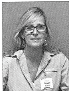
Team Member Since 2019